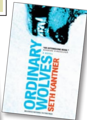
Ordinary Wolves by Seth Kantner Adult/young adult selection